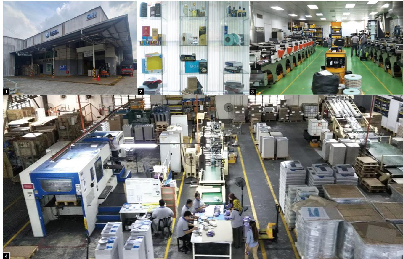
1 Head office and mill 2 Product samples 3 UV flexographic press 4 Processing machine for decorative boxes

Now the company is constantly looking for ways to expand group synergies while creating new revenue streams with TP Malaysia and Adampak Singapore, which it later acquired, and UKB, a packaging company in the region.