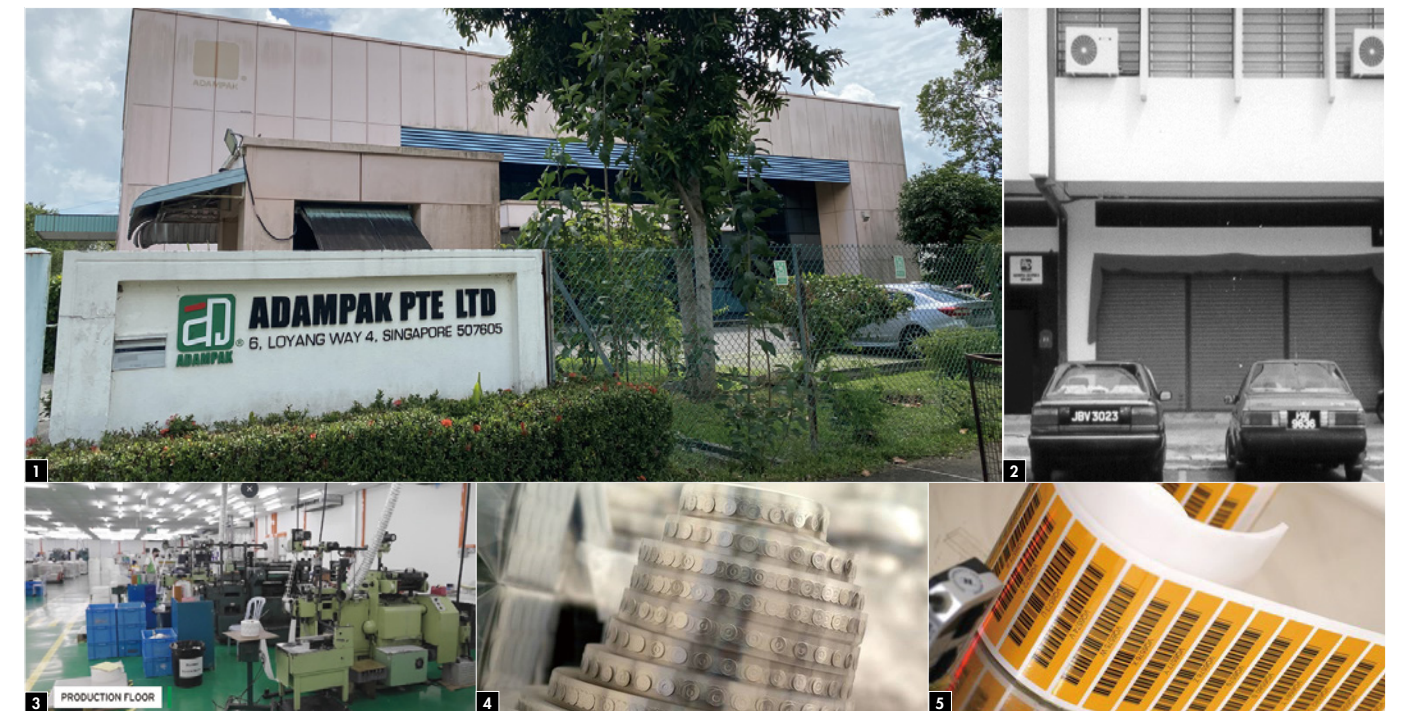
1 Singapore Head Office 2 Aident Corporation (Penang, Malaysia) at the time of establishment in 1994 3 Label processing mill 4 5 Product sample

Oji was interested in Adampak's ability to propose high value-added labels and its supply capacity in the Asian region. With the aim of increasing customer value by achieving integrated production from base paper to processing, the Oji Group made it a wholly owned subsidiary in September 2022. As a member of the Oji Group, Adampak will create synergy between the high quality products of the group companies and their high recognition in the market, and contribute to their customers more than ever as a one-stop packaging solution provider, not just a label printing company.