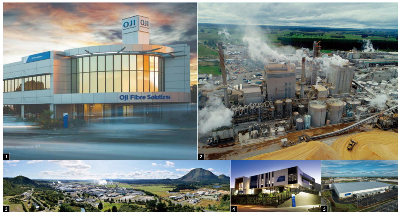
1 Head office (Auckland, NZ) 2 Kinleith Mill (NZ/pulp and paperboard) 3 Tasman Mill (NZ/pulp) 4 New Yatala Mill (Australia / corrugated containers) 5 New Christchurch Mill (NZ/corrugated containers)

In 2022, the Oji Holdings purchased the stake from INCJ and made OjiFS a wholly owned subsidiary. In addition to further contributions to the group's profit, synergies and mutual support with PanPac, which has been operating in NZ for a long time, and its various Southeast Asian bases, which are close in distance, are also expected in the future.