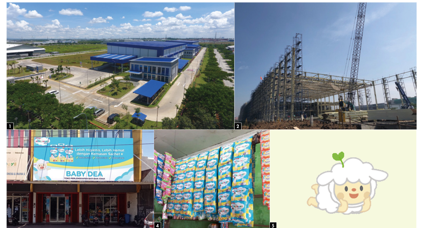
1 Completed mill 2 The mill under construction (at the time) 3 Banner advertisement at Indian Mallet store 4 Products in single-packs displayed in a store 5 Character Omba-chan

The most recent major initiative was the launch of three-pack disposal diapers in addition to the current single-pack. PT has introduced these new forms of products to the market and has seen a steady increase in volume. They will continue to increase production to meet strong demand in Indonesia.