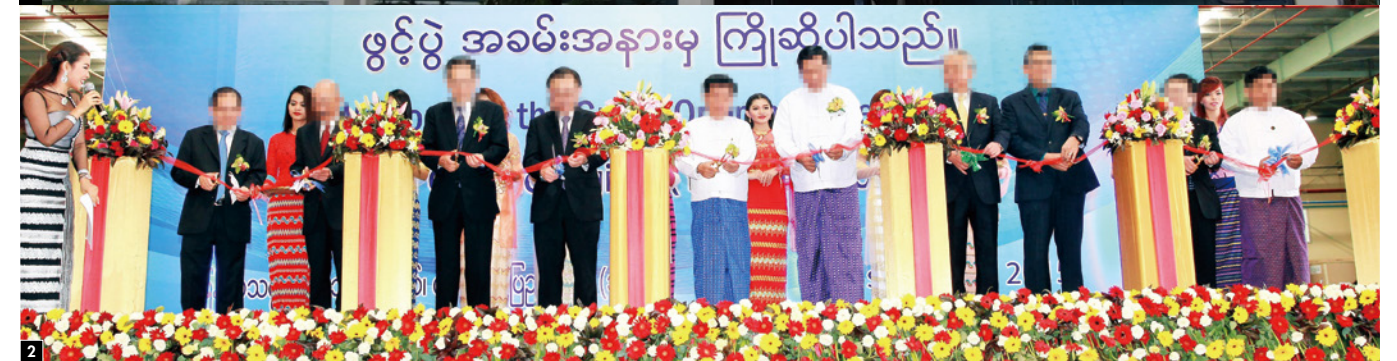
1 Panoramic view of the mill 2 OGPY opening ceremony in August 2015.