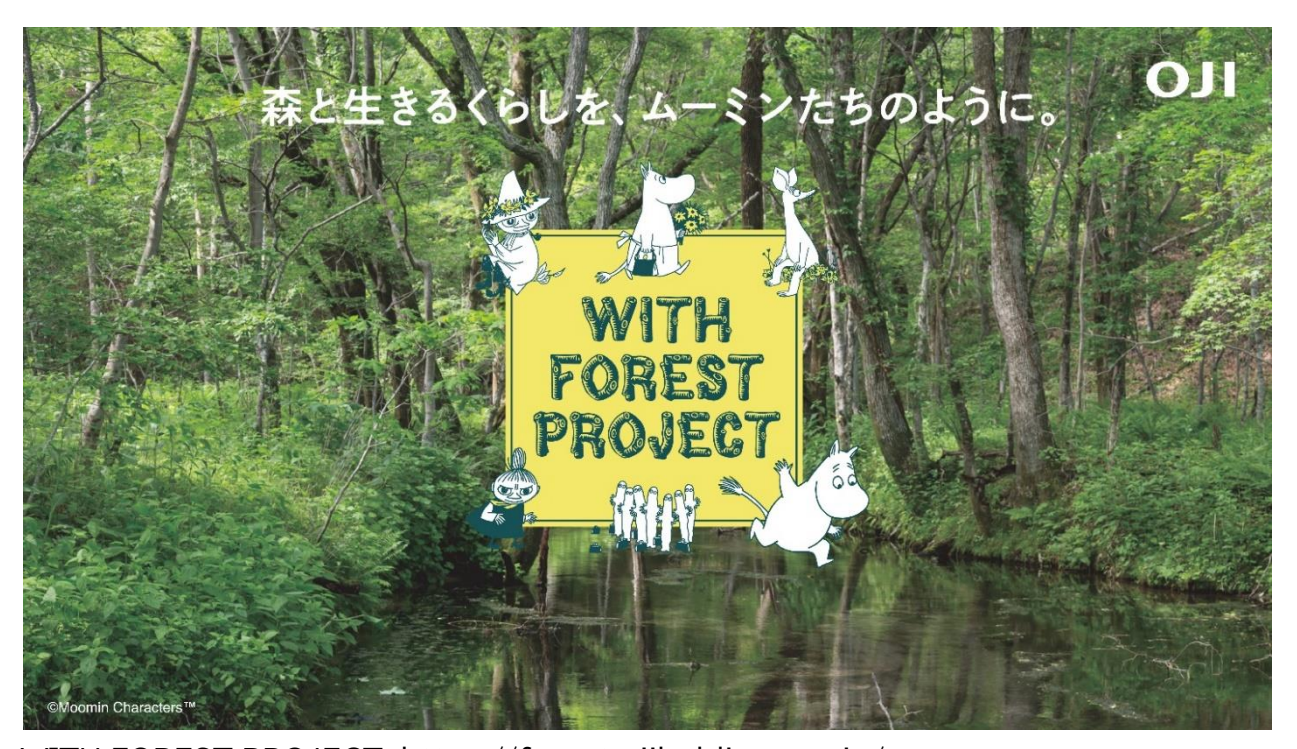
WITH FOREST PROJECT https://forest.ojiholdings.co.jp/

Furthermore, a limited-time pop-up event is planned for this summer in Tokyo, offering visitors an immersive experience of living in harmony with forests.