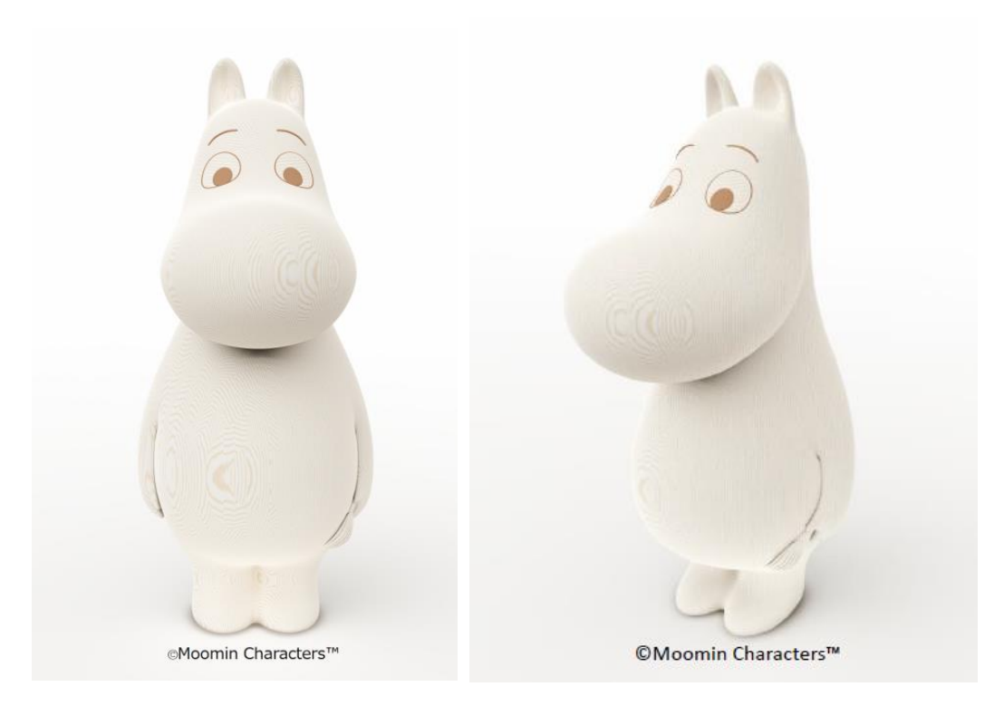
*The image is for reference only.

1. Symbol: Wooden Moomin Statue (Made from Oji Forest Timber)