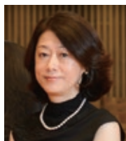
President Hoshino of Oji Hall

The "Oji Hall", located on the third floor within the main building of Oji Holdings, is an authentic concert hall which has been acclaimed by famous Western musicians as well as music enthusiasts, despite its cozy and homelike atmosphere due to having only 315 seats. It hosts high-quality performances and functions as a rental location for about 60,000 audiences annually, leveraging on its central location in Ginza.