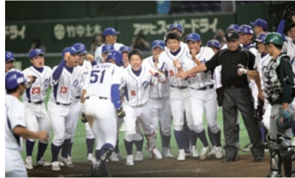
Intercity Baseball Tournament

http://www.ojiholdings.co.jp/baseball/index.html (in Japanese)