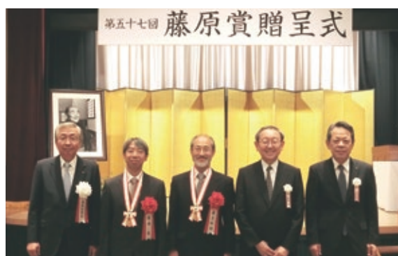
57th Fujiwara Award Ceremony (at Gakushikaikan, on June 17, 2016)

http://www.ojihall.jp/concert/lineup/lineup_eng.html