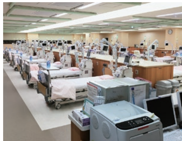
Hemofiltration ward in a newly constructed wing of the hospital