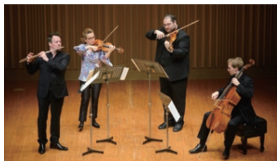
"Emmanuel Pahud with Friends of Berlin" Performance