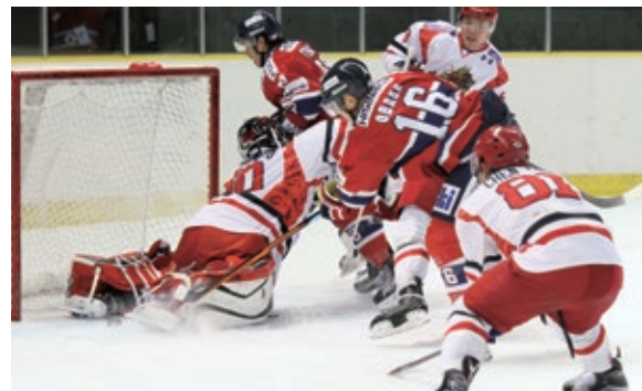
Asia League Ice Hockey

http://www.ojiholdings.co.jp/baseball/index.html (in Japanese)