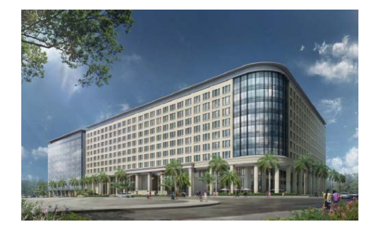
Simulation of Multi-Purpose Complex