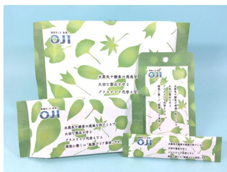
Packaging material with barrier properties

The Oji Group is advancing development of paper material with additional functionalities to replace plastic, centered on its Packaging Promotion Center in Innovation Promotion Division (established on April 1, 2018). SILBIO BARRIER is a paper material but has the function to prevent oxygen and vapor from intruding from outside, thereby helping to prevent the deterioration of contents. It is also able to retain content fragrance and moisture. SILBIO BARRIER has been designed with carefully selected materials so that it has a broad range of packing applications, from foods to industrial materials that require barrier properties. For food contact applications, the Oji Group is advancing the development based on the voluntary standards of the Japan Paper Association. The Group is also preparing for products that use only the materials included on the approved list of the U.S. Food and Drug Administration.