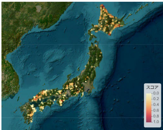
Earthstar Geographics | Esri, TomTom, Garmin, FAO, NOAA, USGS

Importance of Biodiversity (The importance of forest biodiversity increases as the score approaches 1.0 (red).)