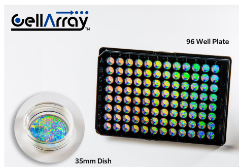
Figure 1 Newly launched "CellArray"

Oji Holdings (President: Hiroyuki Isono; Head Office: Chuo-ku, Tokyo) is pleased to announce that the sales of "CellArray"—a nanostructured cell culture substrate for used in regenerative medicine and drug discovery (Figure 1)—will begin on October 12.