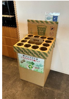
SoftBank Corp. (Takeshiba HQ)