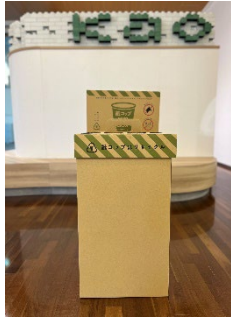
Kao Corporation (Sumida Office)