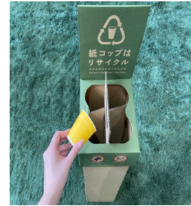
Kokusai Pulp and Paper Co., Ltd (HQ)