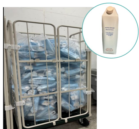
Collection at Hotel Keihan

Using this initiative as an opportunity, we will consider expanding its introduction to all Hotel Keihan locations nationwide.