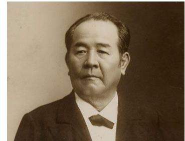
Eiichi Shibusawa (Shibusawa Memorial Museum Collection)

Both Oji Holdings and Keihan Holdings were established by Eiichi Shibusawa, known as the 'Father of Japanese Capitalism.' Shibusawa's 'Theory of the Unity of Morality and Economy' posits that 'morality,' as a responsibility for the prosperity of the nation and humanity, and 'economy,' as the pursuit of corporate profit, must coexist in business. This idea has been passed down through the ages and is reflected in this joint initiative.